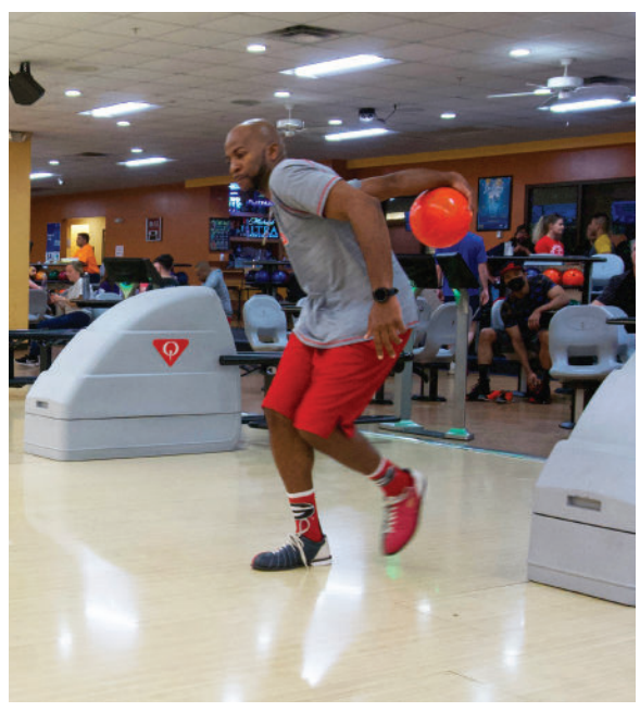
Bowling Tournament at Crossbow Games

Take advantage of the promotional opportunities afforded at a military installation to enhance your visibility and consumer awareness as a community partner of JBLE-Langley's programs and events. By tapping into a well-defined target market, you can take the guesswork out of your media planning while a professional marketing team provides all the promotional coverage. Expand your market, improve profit, and receive immediate and relevant feedback. Additionally, you can have a presence at a variety of events that will generate goodwill for your company and build brand loyalty while supporting the military personnel and families at JBLE-Langley.