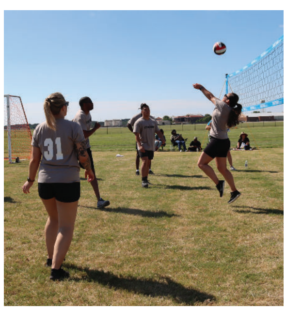
6-on-6 Volleyball at Crossbow Games