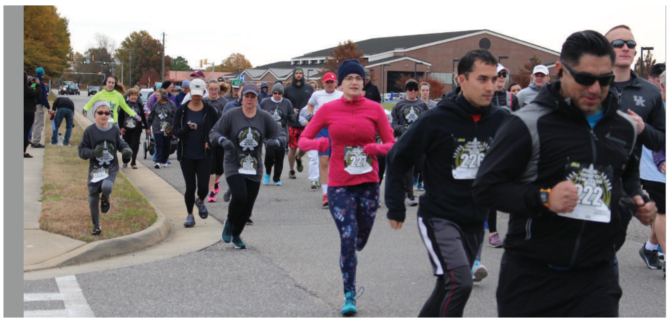
Race 'Round the Base