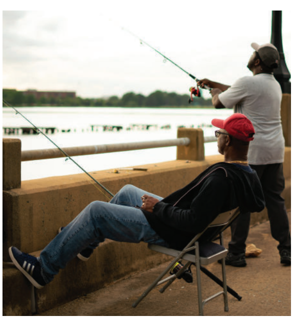
Fishing the King Street Bridge