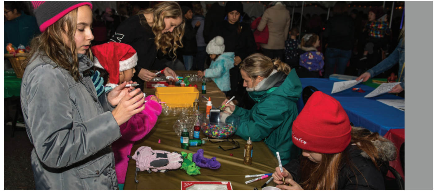
Holiday Tree Lighting

Take advantage of the promotional opportunities afforded at a military installation to enhance your visibility and consumer awareness as a community partner of JBLE-Langley's programs and events. By tapping into a well-defined target market, you can take the guesswork out of your media planning while a professional marketing team provides all the promotional coverage. Expand your market, improve profit, and receive immediate and relevant feedback. Additionally, you can have a presence at a variety of events that will generate goodwill for your company and build brand loyalty while supporting the military personnel and families at JBLE-Langley.