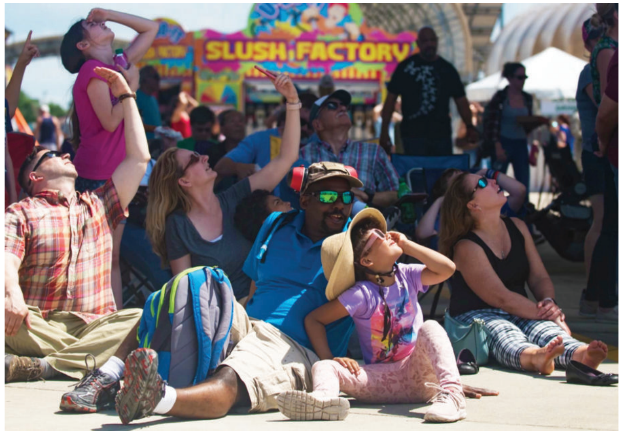
Air Power Over Hampton Roads