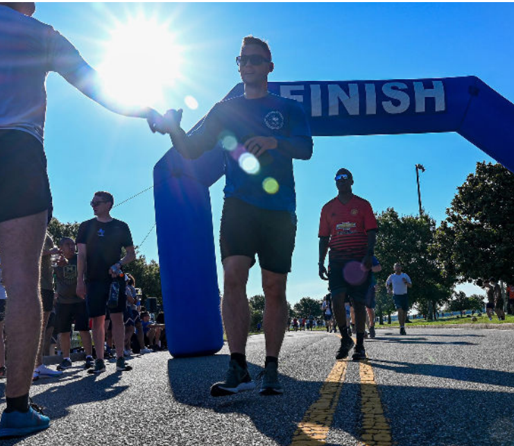
1.5 Mile Run at Crossbow Games