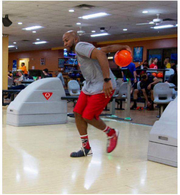
Bowling Tournament at Crossbow Games

P Take advantage of the promotional opportunities afforded at a military installation to enhance your visibility and consumer awareness as a community partner of JBLE-Langley's programs and events. By tapping into a well-defined target market, you can take the guesswork out of your media planning while a professional marketing team provides all the promotional coverage. Expand your market, improve profit, and receive immediate and relevant feedback. Additionally, you can have a presence at a variety of events that will generate goodwill for your company and build brand loyalty while supporting the military personnel and families at JBLE-Langley.