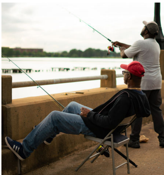
Fishing the King Street Bridge