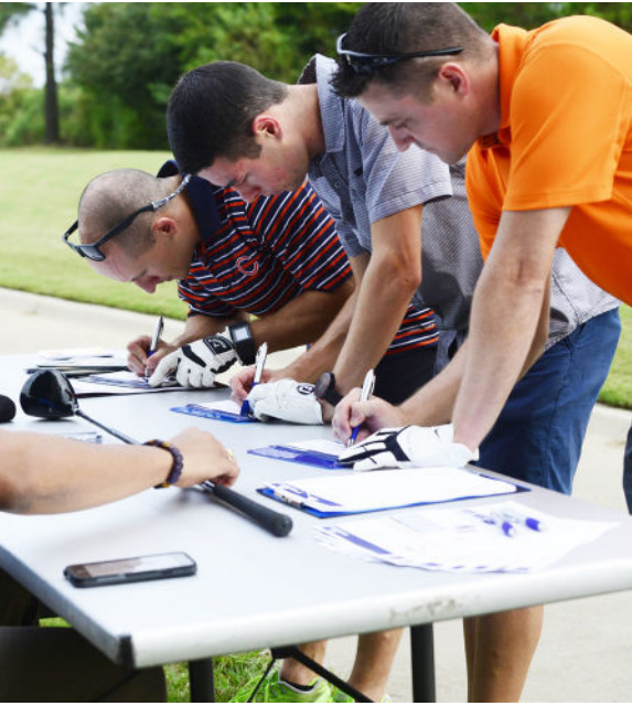
Base Championship at Eaglewood