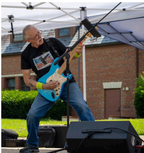
Live Band at Patriotic Palooza