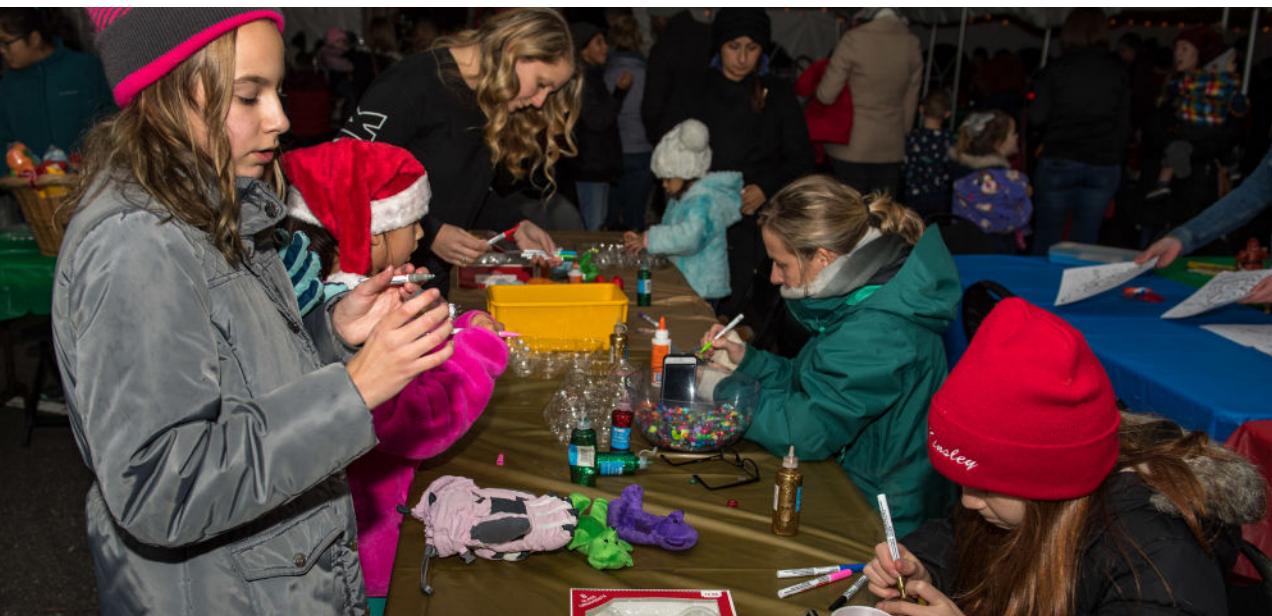
Holiday Tree Lighting

P Take advantage of the promotional opportunities afforded at a military installation to enhance your visibility and consumer awareness as a community partner of JBLE-Langley's programs and events. By tapping into a well-defined target market, you can take the guesswork out of your media planning while a professional marketing team provides all the promotional coverage. Expand your market, improve profit, and receive immediate and relevant feedback. Additionally, you can have a presence at a variety of events that will generate goodwill for your company and build brand loyalty while supporting the military personnel and families at JBLE-Langley.