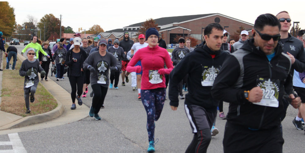
Race 'Round the Base